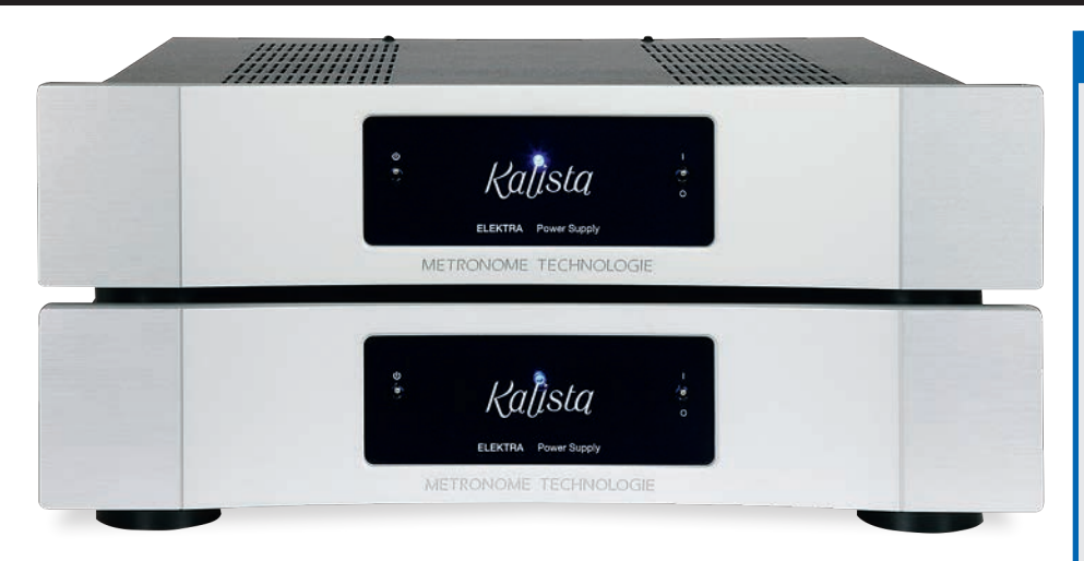
ABOVE: The Kalista DreamPlay CD transport and DAC both come with outboard Elektra power supplies. Both transport/DAC front displays may be defeated via a switch on each power supply