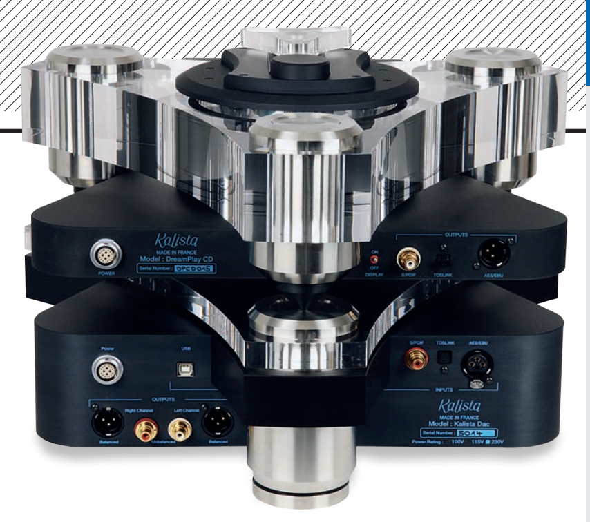
ABOVE: The DreamPlay CD transport [top] offers coaxial and optical S/PDIF outputs alongside AES/EBU while the Kalista DAC [bottom] has matching digital inputs plus USB-B. The balanced (XLR) analogue outputs are transformer-coupled

that has a heavier touch – rather more akin to an effects processor. It conferred a sense of greater weight and power to this somewhat effete '90s indie band, yet I found it harder to sit back and enjoy the subtleties of the recording. It's an interesting feature, but my preference would have been to make it more subtle.